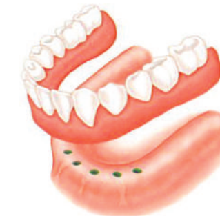
implant supported dentures