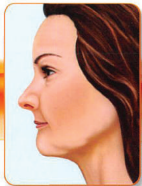
profile starts to change (after tooth loss)