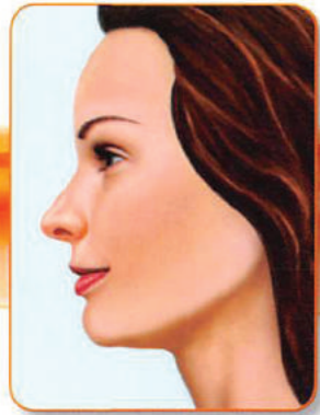
normal profile (no tooth loss)