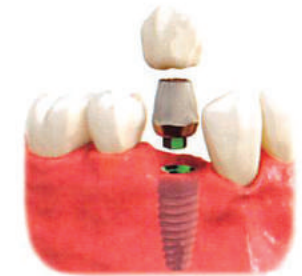
dental implants with a crown