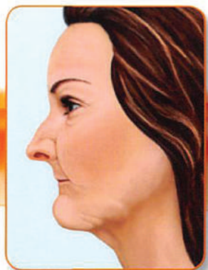
bone loss continues (without intervention)