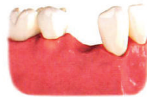
untreated missing teeth