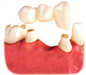
traditional crown & bridge